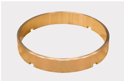
UPPER HEAD BUSHING