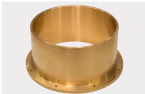
LOWER HEAD BUSHING