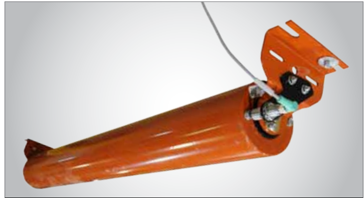
Sentinel Belt Speed Sensor