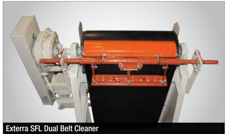
Exterra SFL Dual Belt Cleaner