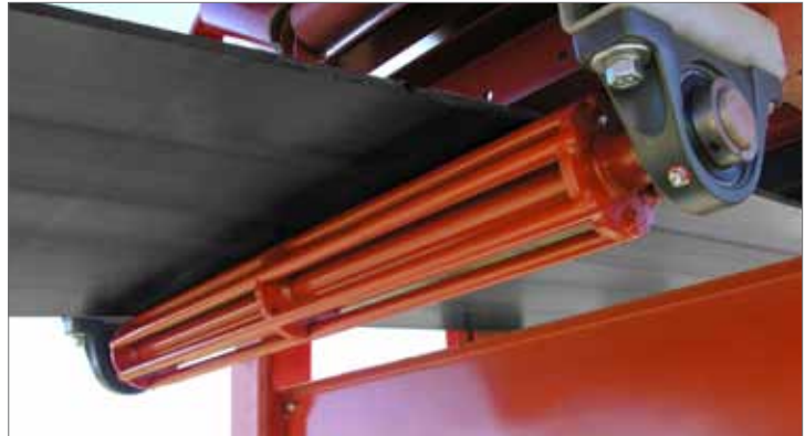
Beater Bar Return Rolls