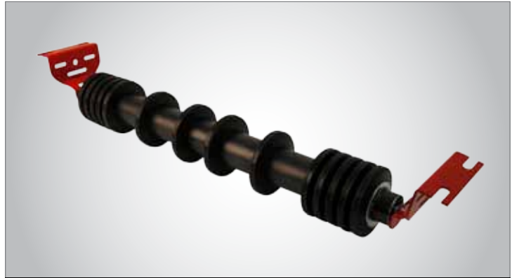
Rubber Disc Return Idler

1-800-321-1558 Find local distribution at superior-ind.com/distributor © 2012 Superior Industries CL-109