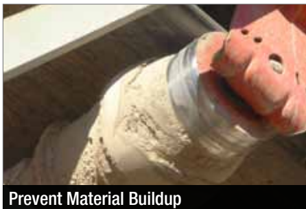
Prevent Material Buildup