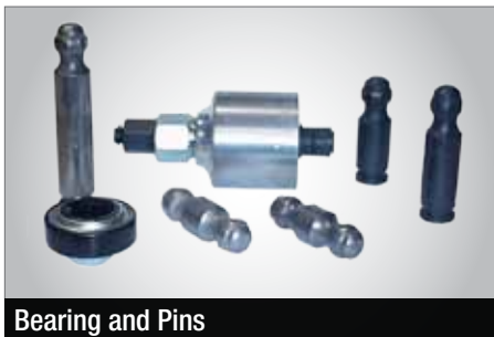
Bearing and Pins