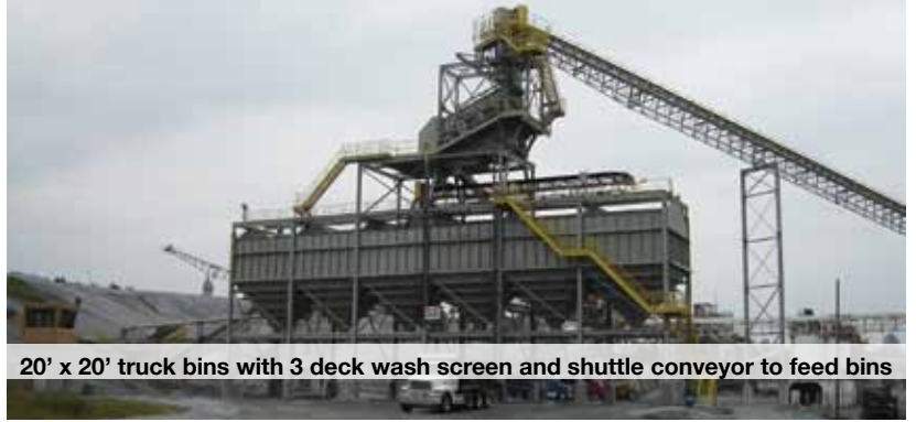
20' x 20' truck bins with 3 deck wash screen and shuttle conveyor to feed bins