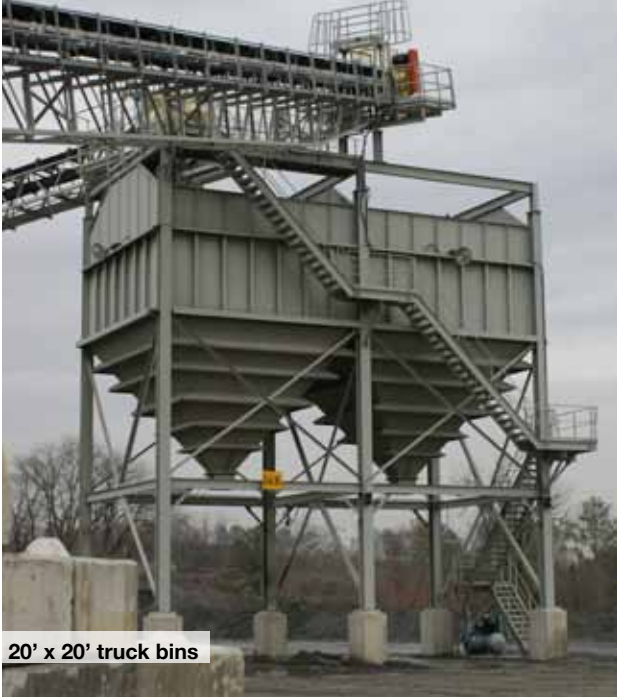
20' x 20' truck bins