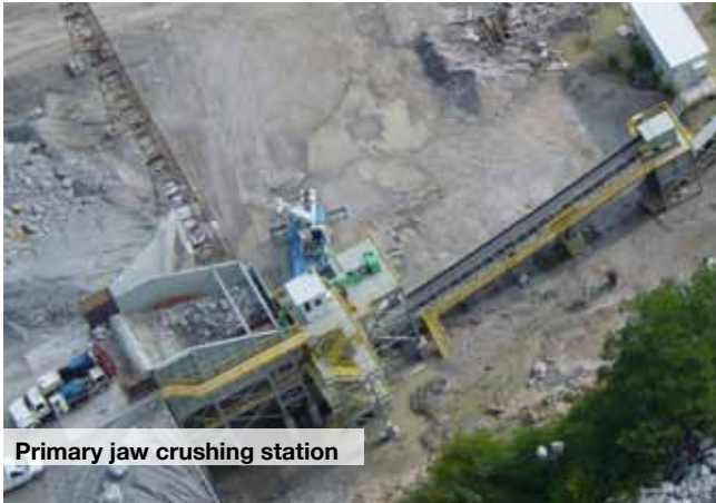
Primary jaw crushing station