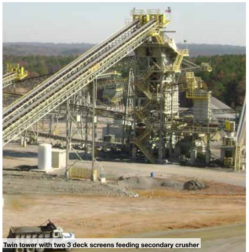
Twin tower with two 3 deck screens feeding secondary crusher