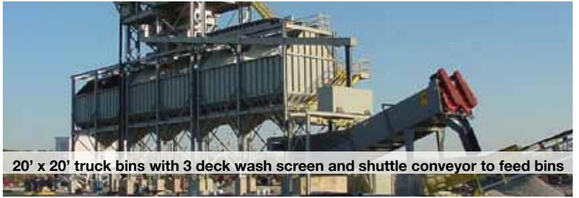
20' x 20' truck bins with 3 deck wash screen and shuttle conveyor to feed bins