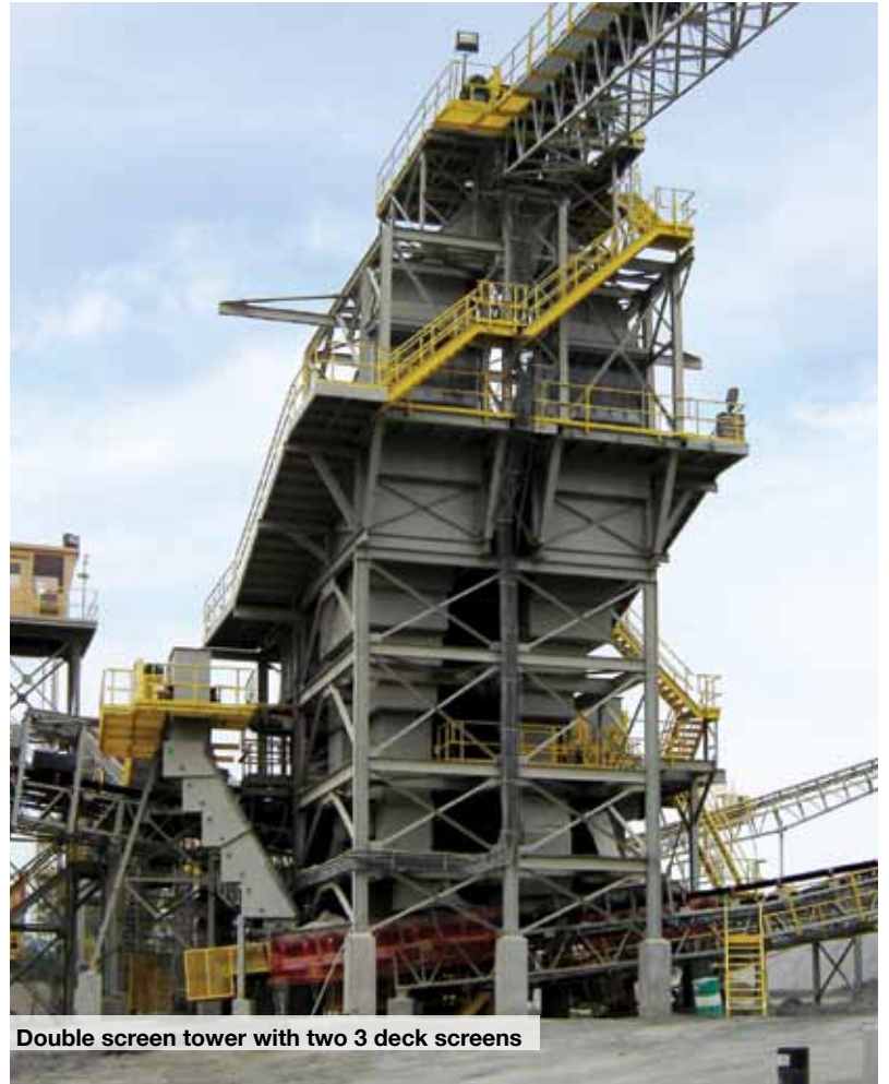
Double screen tower with two 3 deck screens