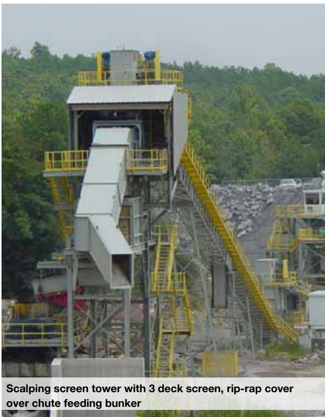
Scalping screen tower with 3 deck screen, rip-rap cover over chute feeding bunker