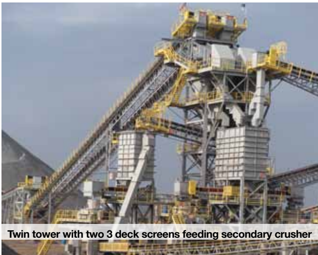
Twin tower with two 3 deck screens feeding secondary crusher