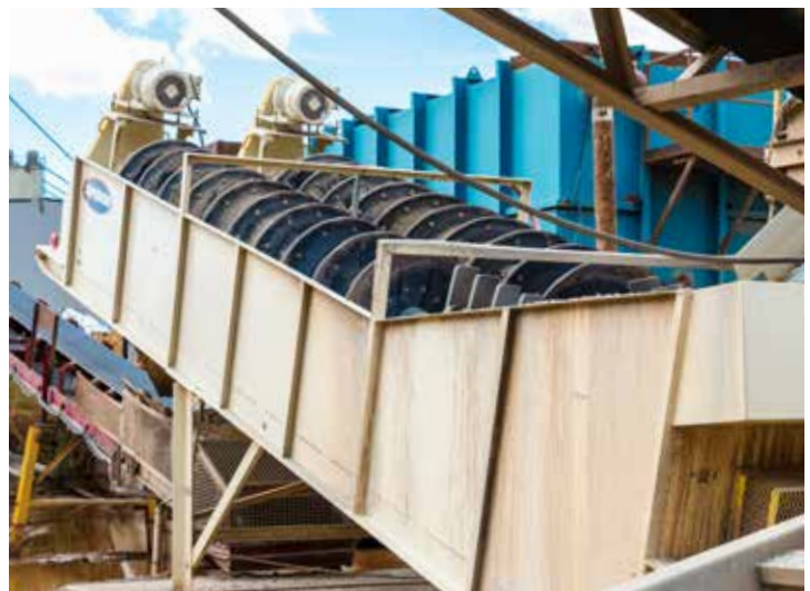
06/ SINGLE OR TWIN SCREWS