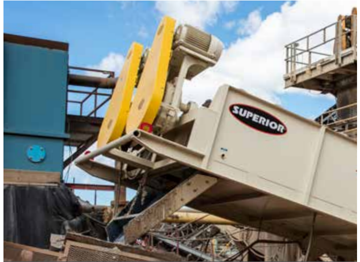
04/ FULLY-GUARDED DRIVE SYSTEM