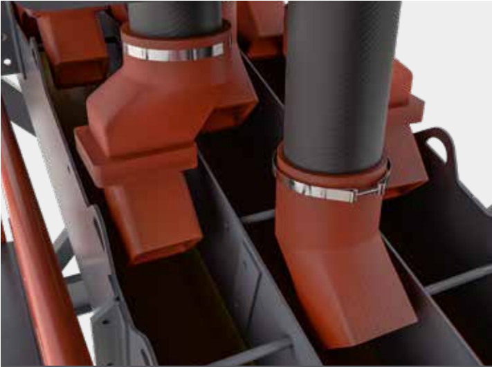
04/ URETHANE DISCHARGE VALVES