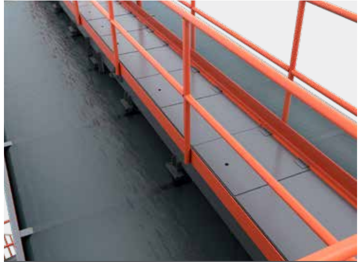
07/ ELEVATED VALVE BRIDGE