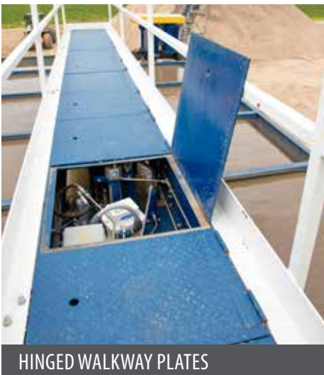
HINGED WALKWAY PLATES