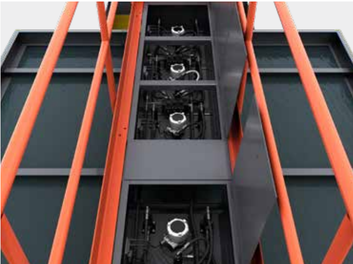
08/ HINGED WALKWAY PLATES