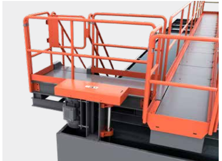
10/ RECIRCULATING PUMP