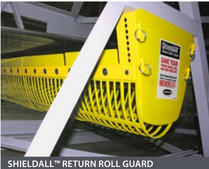
SHIELDALL™ RETURN ROLL GUARD