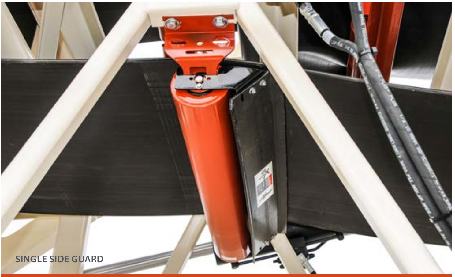
SINGLE SIDE GUARD