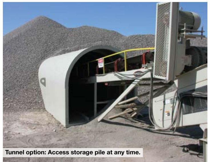
Tunnel option: Access storage pile at any time.