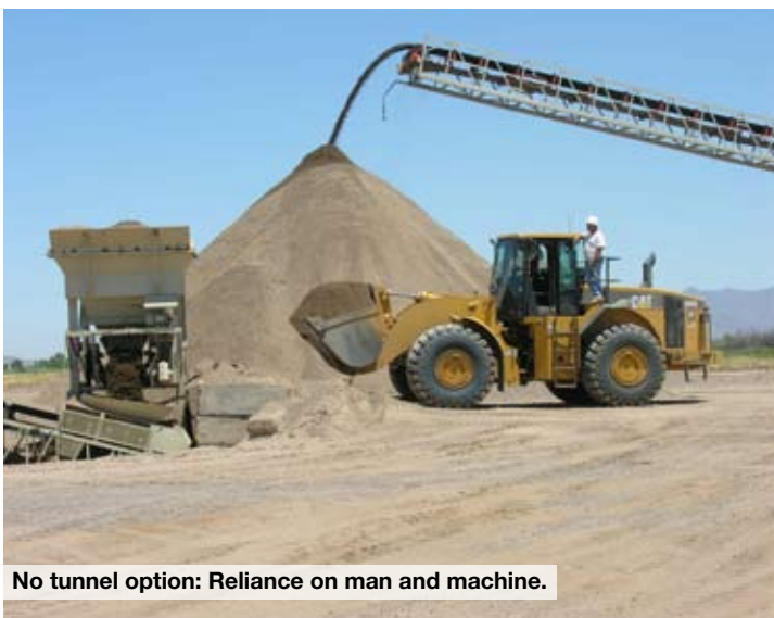
No tunnel option: Reliance on man and machine.